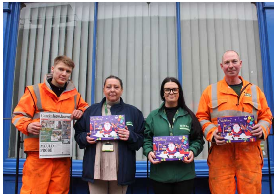
Staff from Murphy's construction company delivering to the Tribune office