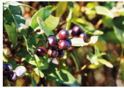
Ligustrum (privet), or laurel