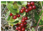
Smilax and Zanthoxylum