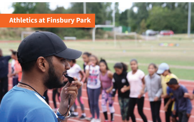
Athletics at Finsbury Park