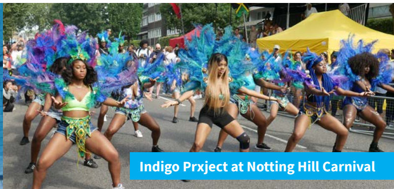
Indigo Prxject at Notting Hill Carnival

Wednesdays 26 July - 23 August | 6.30 - 8pm