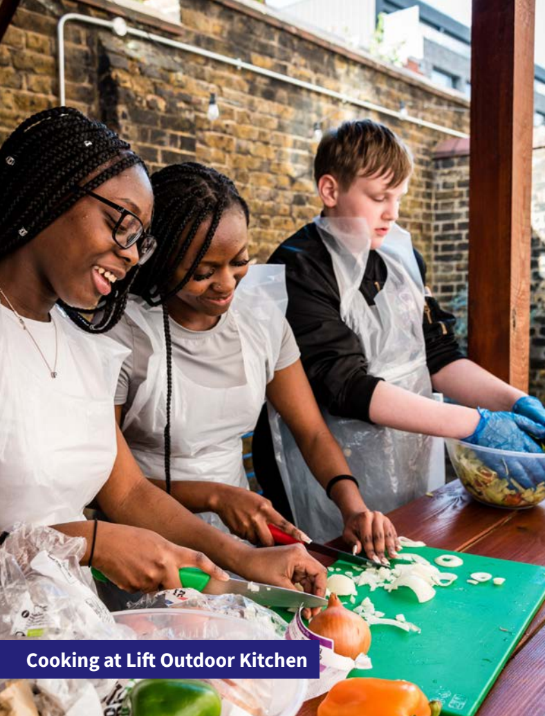
Cooking at Lift Outdoor Kitchen