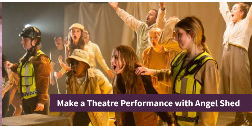
Make a Theatre Performance with Angel Shed