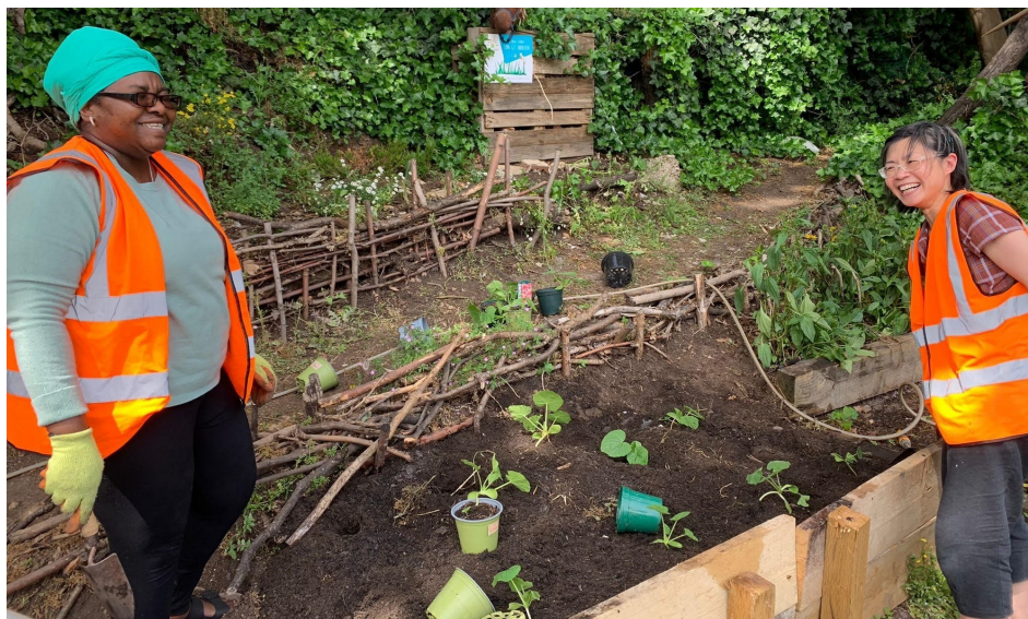
The plant arriving at platform 1... volunteers at work with Energy Garden g.uk

Energy Garden is also running a youth training programme in renewable energy: students will get a grounding in the green economy, through a mix of tutorials, meeting industry figures and instruction in green technology, including the setting up of solar panels. The course runs for 40 hours over the summer and is open to anyone aged between 16 and 19. Please send your CV to sian@energygarden.org